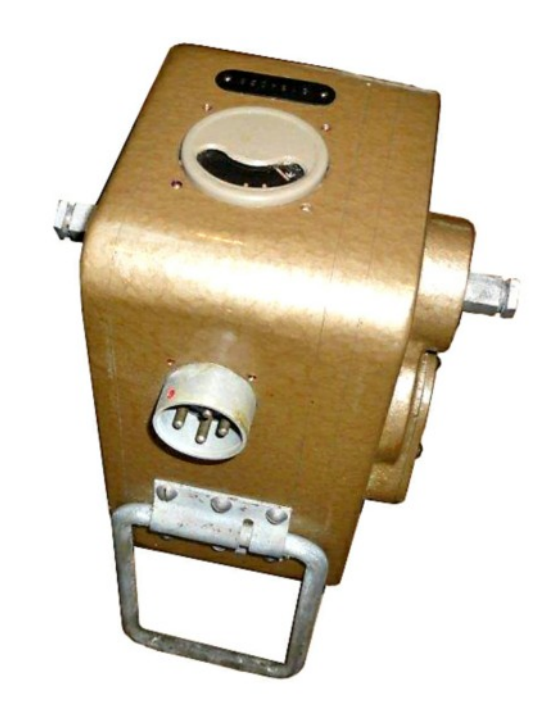
Side and top close-up view of the Mk.818A generator with hinged clasps for attaching it to a base plate.