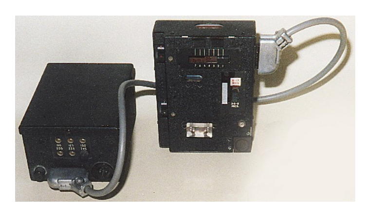
Transmitter Mk.217 (right) with associated AC mains power supply unit (left). It is believed that a 6V DV vibrator power pack was also issued with a complete station. See chapter 216 and the 'Mk.217' section in the 'Great Britain' chapter of 'WftW Volume 4.

Hand generator Mk.818A was used to provide power for transmitter Mk.217 (Chapter 216) in an emergency when no other source of power was available. Its general appearance resembles the hand/pedal generator Mk.810A, described in the 'Power Generators' chapter of WftW Volume 4.