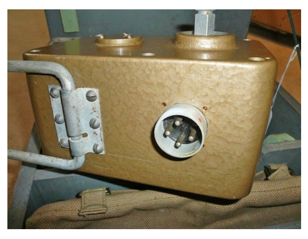
Side view of generator showing the round 4-pt plug