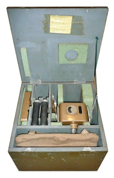
Top view of Mk.818A transport case with opened lid showing its contents.