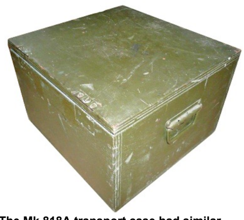
The Mk.818A transport case had similar construction details as that from the Mk.819 described in Chapter 215, and Mk.123.