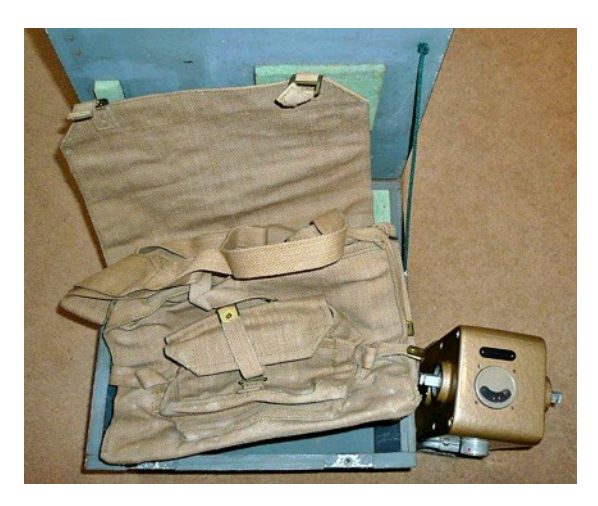
Close-up view of canvas carrying bag for the Mk.818A. It is believed to be similar to that of the Mk.810A.